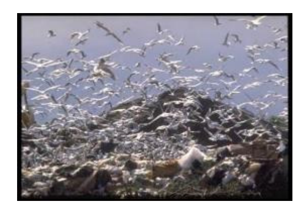
Figure 2. Birds at the landfill