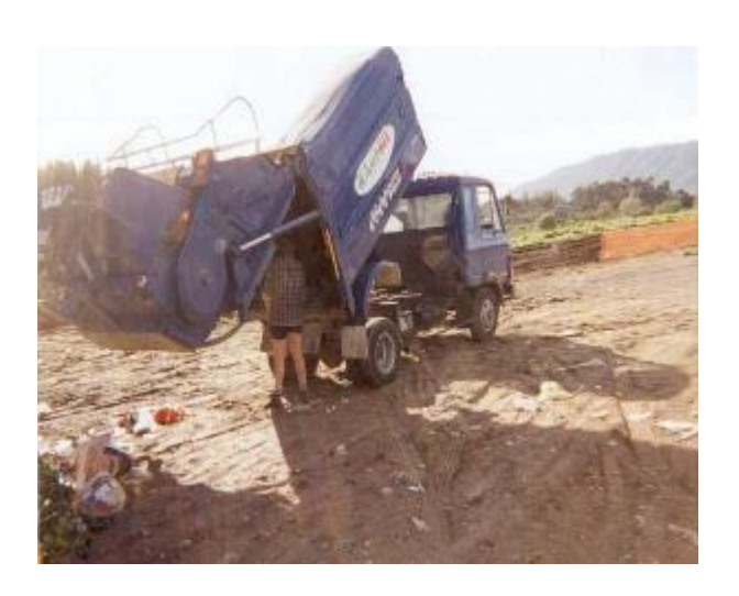
What not to do!

Site safety, is maintained and/or achieved through careful planning, the provision and utilisation of appropriate equipment, and through personnel training. Site plant and all structures should be equipped with fire extinguishers. A well-stocked first aid kit should be available on-site and first aid training should be considered essential for one or more of the operating personnel who spends the majority of the working day on the site. At least one person properly trained in first aid should be on site at all times.