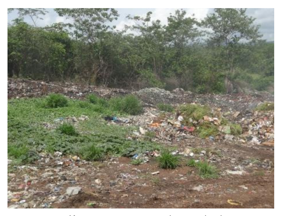
Kenema present waste dump on banks

Kenema dump is only 5 acres in size and with some 52,900 tonnes of waste per year to process. The waste analysed shows that some 65% of this material is bio-waste, 10% being inert material. The City council also want to move its waste management operation service and the waste enterprise zone out to the new proposed landfill site. To achieve both the processing of bio-waste, landfilling and operational service, as well as an enterprise zone, the minimum size site needed would be 10 acres to support the service over the next 25 years, at a growth rate of 3%. For best practice, the minimum area needed to process the bio-waste would be one hectare with some 240,000 cu ms of void space for the disposal of the residual waste. This should include the excavation to 4 m depth in each cell and raising the waste above the ground level a minimum of 10 ms ensuring side slopes not steeper than 1:5.