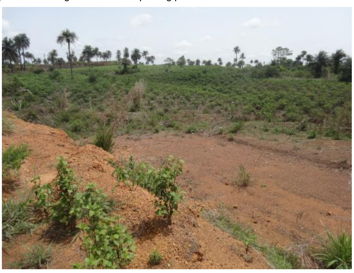
Makeni proposed landfill site

disposal over the next 25 years, at a growth rate of 3%. For best practice, the area needed to process the bio-waste would be three quarters of a hectare. The site would also need some 78,000 cu ms of void space for the disposal of the residual waste. This should include including the excavation to below ground level to 4 ms depth and rising above the ground to a minimum of 10 ms ensuring that side slopes do not exceed 1:5. There is a water course some 200 ms away from the site which is not expected to impact on the development or the ongoing operation of the site. Site inspection took place 11<sup>th</sup> May with WHH and the site seems to be well placed to accommodate all the facilities needed at the site, including weighbridge, site office, recycling material and transport shed. The biggest issues on water entering the site, comes from the wet waste processing facility presently managed by SALWACO, which has both emergency overflow pipes and surface water drainage coming out of their facility and running across the landfill. This needs to be diverted into the proposed water lagoon for the composting pad.