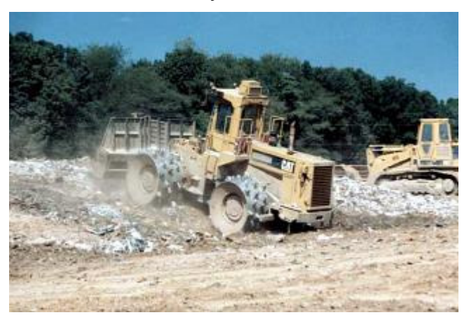
Figure 3. Wastes compacted by bulldozer/compactors

Compaction is typically achieved using a bulldozer or a specialist waste compactor, as shown at Figure 3. However at sites receiving small volumes of waste typically a wheeled loading shovel together with the weight of the vehicles delivering the waste will lead to in place densities at or near to 0.8 t/m^3 should be readily achievable. Densities less than 0.6 – 0.7 t/m^3 significantly reduce landfill efficiency and will increase the risk of landfill fires.